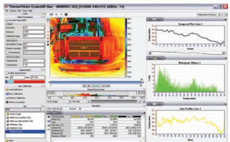
ThermoVision ExaminIR example display

NEW! RUGGED & LIGHTWEIGHT MAGNESIUM HOUSING!